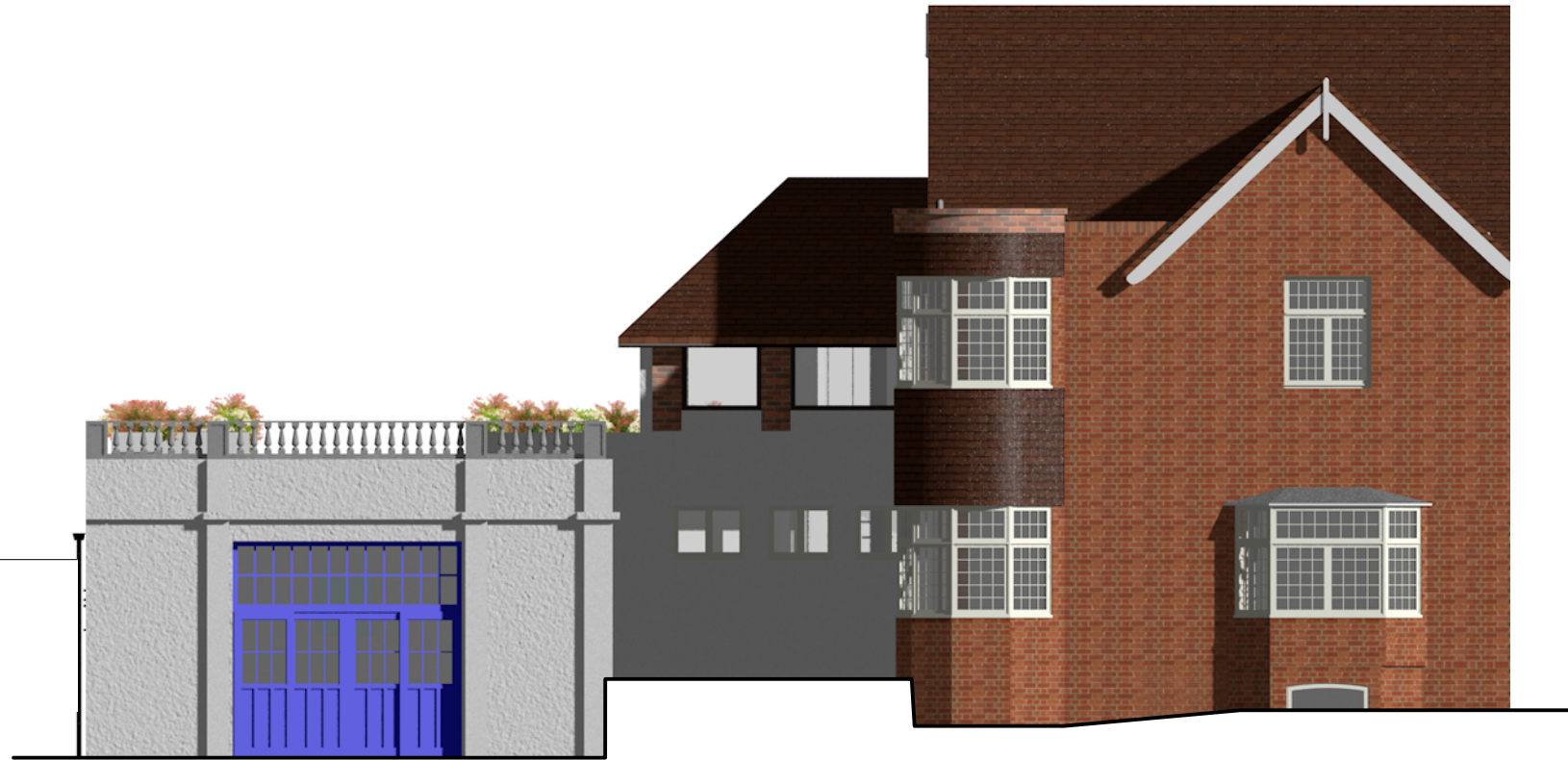
PROP. SOUTH WEST ELEVATION 1:100